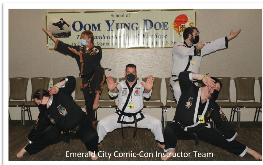
Emerald City Comic-Con Instructor Team

After delays and rescheduling due to pandemic restrictions, Emerald City Comic Convention (ECCC) made it back to the Seattle area this year and so did we. Instructors and students love coming out to this event and sharing our Samurai Sword sparring lessons. These lessons are always a huge hit among the thousands of people who attend the event, and this year was no different. Even with being invited